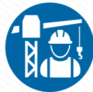
Category V and VI Construction